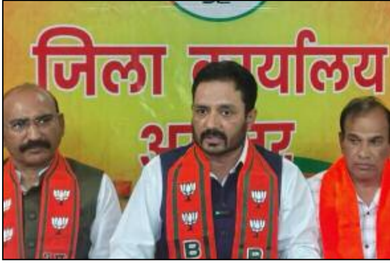
JAMMU, JUNE 17