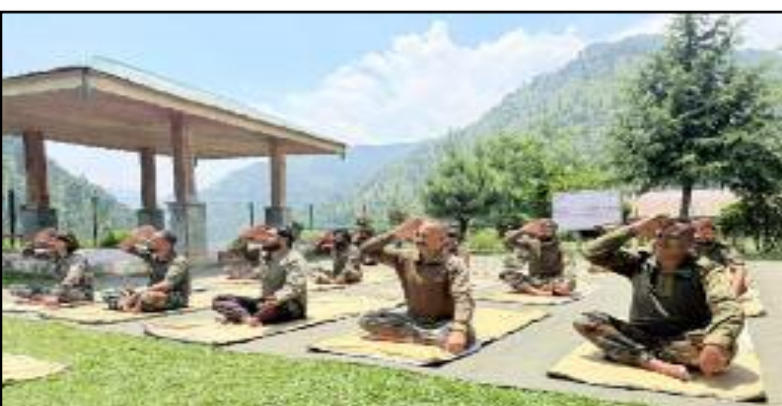
POONCH, JUNE 17

A lecture cum awareness session on the importance of yoga was organized at Loran Village today by the Indian Army as part of its ongoing efforts to promote health, wellness and com-