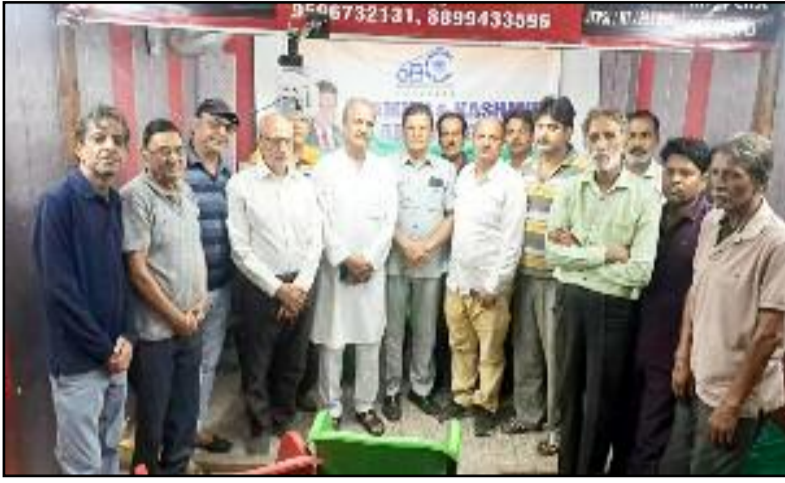
JAMMU, JUNE 17